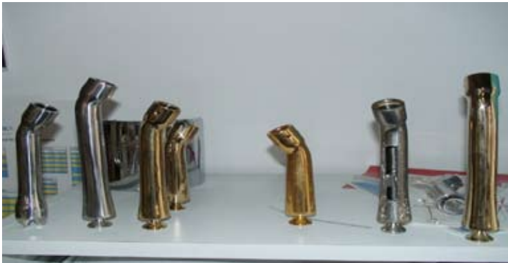
Figure 4. Various TurboTap Models