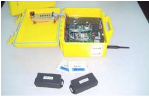
Figure 5. OnSiteERT's Emergency Resource Tracking System

The possible technical courses that could benefit from this case study are in the areas of computer science, software development, or geographic information systems. At UDM, this case has been embedded in an introductory computer science course. Technical discussions involve software requirements and techniques to sub-divide the software development, as well as verification methods.