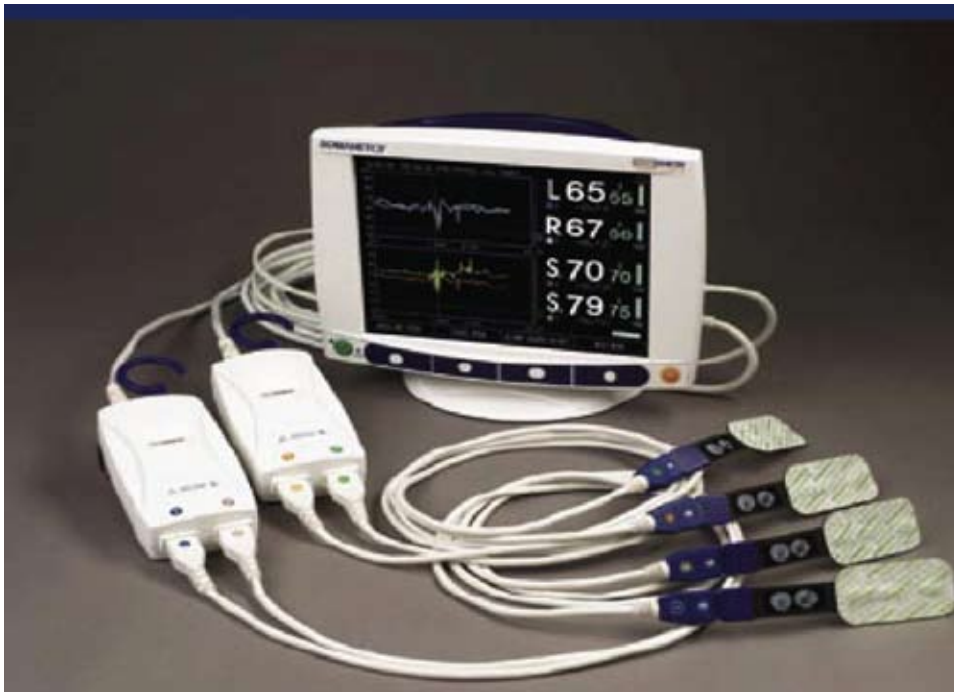
Figure 3. INVOS Cerebral Oximeter

Somanetics develops, manufactures, and markets the INVOS Cerebral Oximeter (Figure 3), which is a noninvasive patient monitoring system that continuously monitors changes in the blood oxygen levels in the brain. At the time this case was developed, the INVOS Cerebral Oximeter was the only commercially available system of its kind in the US (Somanetics 2009).