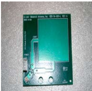
Figure 9. Monarch's Self Structuring Array

Monarch Antenna is a spin-off of Delphi Automotive. It is a partnership between Delphi, NASA, Automation Alley, Ann Arbor Spark, Michigan State University, The University of Michigan, Purdue University, Virtual EM, SC Solutions, and SmartSynch. Its core technology is a self-structuring antenna (SSA) consisting of a matrix of small antenna segments connected by switches. An example of this product is shown in Figure 9.