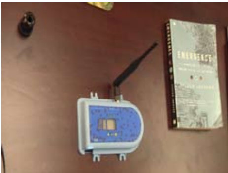
Figure 10. Regen Energy's Module (left); Emergence (right)

Mark Kerbel and Roman Kulyk co-founded REGEN Energy in Toronto in 2005. The company's Envirogrid Controllers form a wireless energy management solution designed to lower utility bills by reducing peak current draw. The principles in Johnson's Emergence (2001), coupled with inspiration from the swarm logic of bees led to the development of the product. The product and the book Emergence are shown in Figure 10.