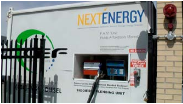
Figure 11. CEF's Biofuel and Emissions Fluids Dispensing Station

This case could be slanted in many technical directions. At UDM, it will be incorporated into the heat transfer course, and students will be required to do sample heat transfer calculations on the energy needed to maintain safe fluid temperatures in winter. Other course options include internal combustion engines, chemistry, or fluid mechanics.