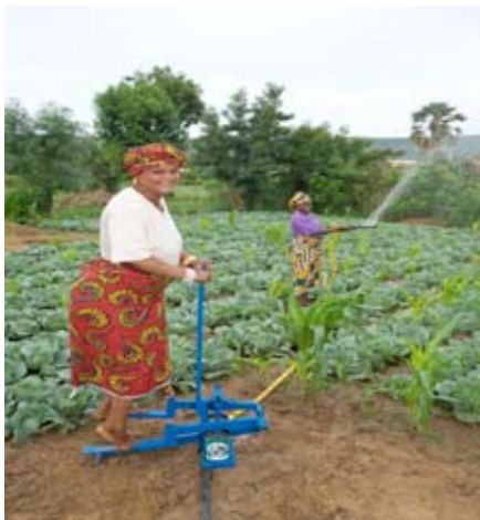
Figure 6. KickStart's Super MoneyMaker Irrigation Pump