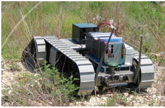
Figure 8. Adaptive Materials' Fuel Cell-Powered Mobile Robot