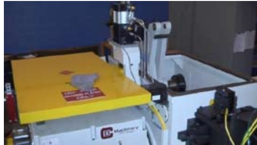
Figure 7. Original Hood Design (left); Hood with Vertical Hinge Axis (right)

This case is being integrated into UDM's Manufacturing Processes course. Other schools may find it applicable in other course areas as well.